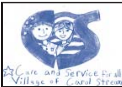
1st Place Winner Brian Nugyen

In October of this past year, the Village hosted a vehicle sticker design contest in the grade schools asking local school students to submit a sticker design of their most favorite thing about Carol Stream. In all, 94 entries were submitted which were then submitted to a panel of private citizens for their review. The judges work was most difficult because of the quality of the designs that were submitted, but in the end, 3 designs stood out as most closely meeting each of the 5 criteria for reproduction, namely color, image clarity, originality, creativity and scale. The following Western Trails students submitted award winning designs: